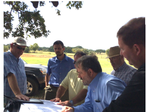
Meeting with Toll Brothers on the land, October 13, 2017

The property bordering our land on the south is owned by Toll Brothers, home builders. A future development is planned by Toll Brothers, which will require the construction of a road between our two properties. On Friday, October 13, representatives from St. Philip's and the Diocese of Fort Worth met with representatives of Toll Brothers (pictures at right) to discuss plans for the new road. You may see some construction underway in the coming months!