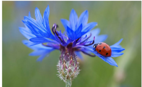
ST. PHILIP ALTAR FLOWERS